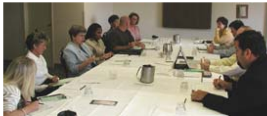
JobNet participants share job search "Best Practices".